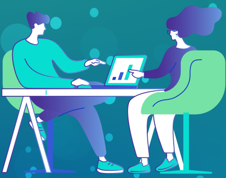
COORDINATION CENTER of TLD .RU and .РФ