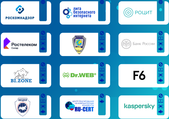
INTERNET (END) USER

Project of the Coordination Center for setting the interaction between Expert Organizations with Accredited Registrars to prevent illegal using of domain names in .RU and .РФ. Expert organizations have the necessary knowledge and skills for detecting websites with illegal content, collecting and reporting incidents of phishing, unauthorized access to information systems and spreading malware. The Coordination Center granted these organizations the right to request Accredited Registrars to terminate domain name delegation for violating websites. According to TERMS and CONDOTIONS Registrars also have the right to terminate domain name delegation upon requests from the Expert Organizations.